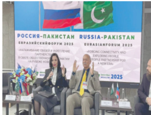
Senator Mushahid Hussain speaking at a forum.