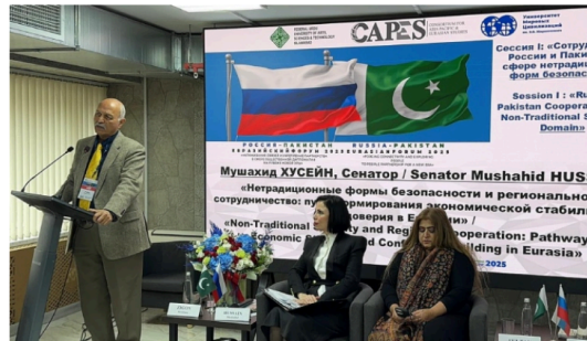
Senator Mushahid Hussain speaks at Pakistan-Russia Eurasian Forum 2025.